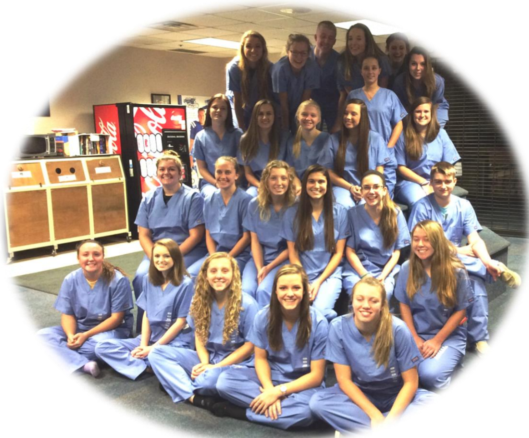
Health Careers Students